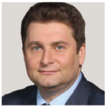
Aleksandr Morozov Deputy Minister of Industry and Trade of the Russian Federation